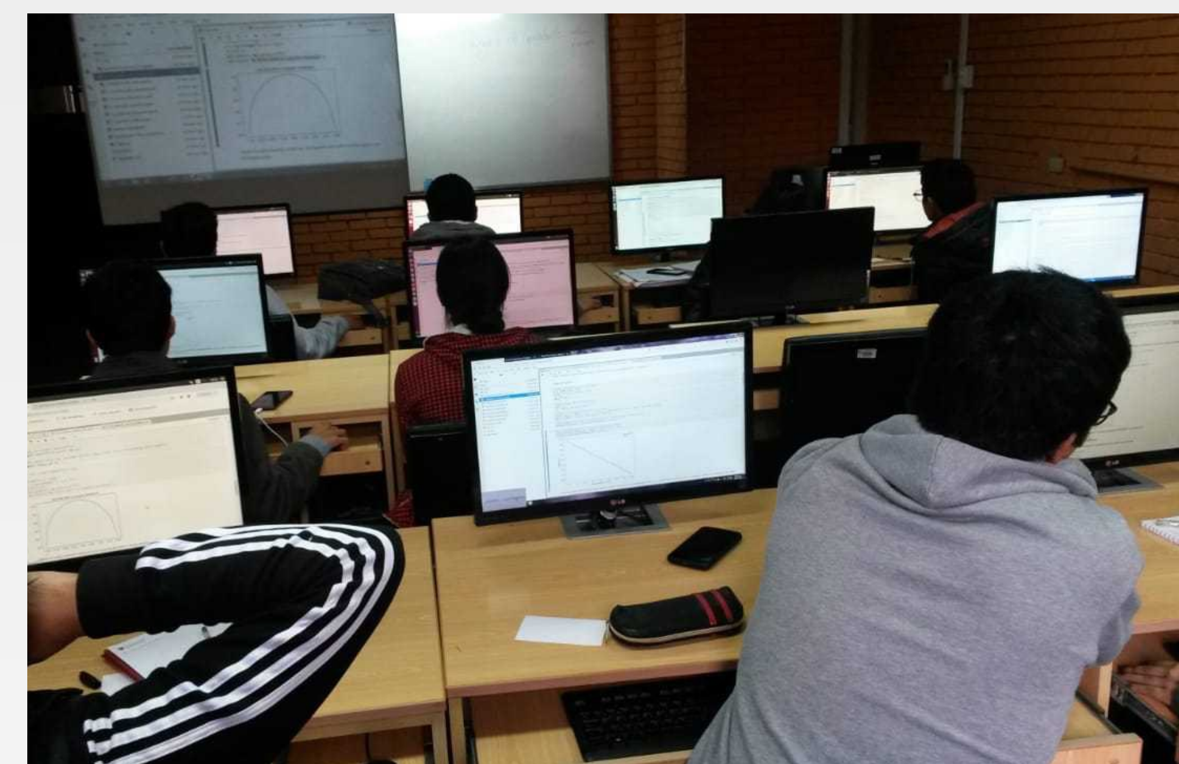
Figure 2. A participant leans over to confer with his neighbour about an exercise in their notebooks.

Workshop participants ranged in age (17-22), career level (secondary school, B.Sc., applying for M.Sc.), and professional interests (geosciences, conservation, civil engineering). None had prior experience in ice dynamics or in Earth system modelling.