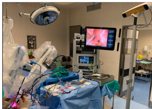
Figure 3. Intraoperative image-guided navigation system with fixed array surgical disposition.