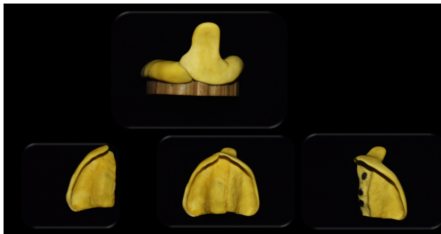
Figure 2. Maxillary sectional trays with a locking mechanism using magnet. Note the magnets that are in the inner surface of the bigger section and outer surface of the smaller section.