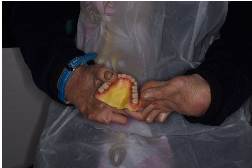
Figure 4. Hands deformity.