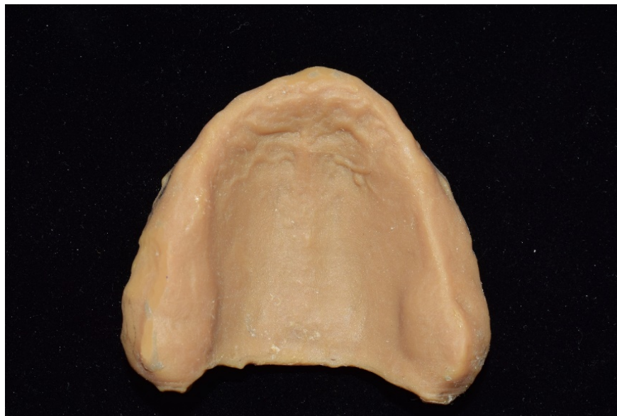
Figure 1. Printed maxillary cast.