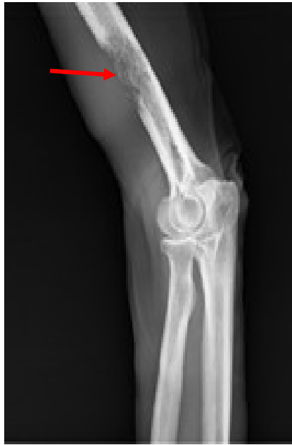
Figure 1: Pathologic fracture on a lytic lesion (arrow), X-ray of the right humerus