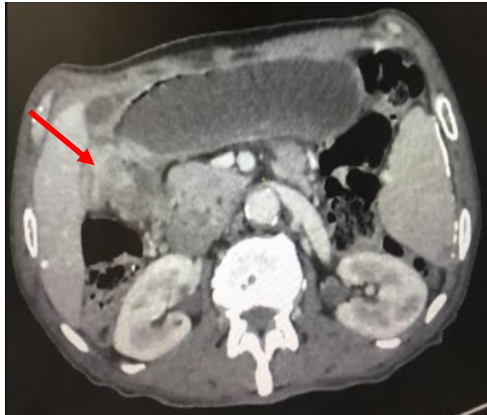
Figure 3: Gastric mass (arrow), CT scan