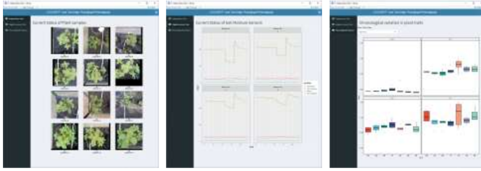
Figure 2. User interface of developed HTPP for visualization