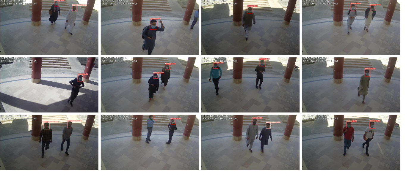
Fig. 3: Qualitative examples of our masked/non-masked face detection method on our face mask dataset.

RetinaNet-101, Fast-RCNN, Faster R-CNN (FPN), Faster-RCNN (ResNet-50) and Faster-RCNN (ResNet-101). For instance, YOLO-v3 achieved 64.1% mean accuracy, 59.6% mAP, 53.1% mAP @ 0.95 and 28ms inference time. Similarly, SSD achieved 61.8% mean accuracy, mAP 56.2%, mAP @ 0.95 is 48.6% and take 34 prediction time. Also, RetinaNet-50 demonstrate 55.2% mean accuracy, mAP 51.9%, mAP @ 0.95 is 44.7% with the inference time of 37ms on the test set. Whereas, RetinaNet-101 achieved 51.0% mean accuracy, mAP 46.3%, and 44.7% mAP @ 0.95 with 39ms inference time which is comparatively higher than RetinaNet-50. On the other hand, We next analyze the multi-stage object detector i.e., Fast R-CNN which demonstrated 41.7% mean accuracy, 39.4% mAP, and 37.1% mAP @ 0.95 with 132ms inference time on the our test set which is significantly higher than the employed single shot detectors. In another experiment, Faster R-CNN based on FPN 119 achieved mean accuracy of 47.3%, 44% mAP, and 41.5% mAP @ 0.95. Whereas, the sample Faster R-CNN with ResNet-50 feature extraction network achieved mean accuracy of 59.0%, mAP 44%, and 57.4% mAP @ 0.95 with inference time of 108ms. However, with ResNet-101 as a backbone feature extraction network, Faster-RCNN shows mean accuracy of 62.7%, mAP 61.3%, and 59.0% mAP @ 0.95 with inference time of 98ms. Consequently, it can be assumed that YOLO-v3 with DarkNet-53 can achieve better accuracy after further architectural fine-tuning.