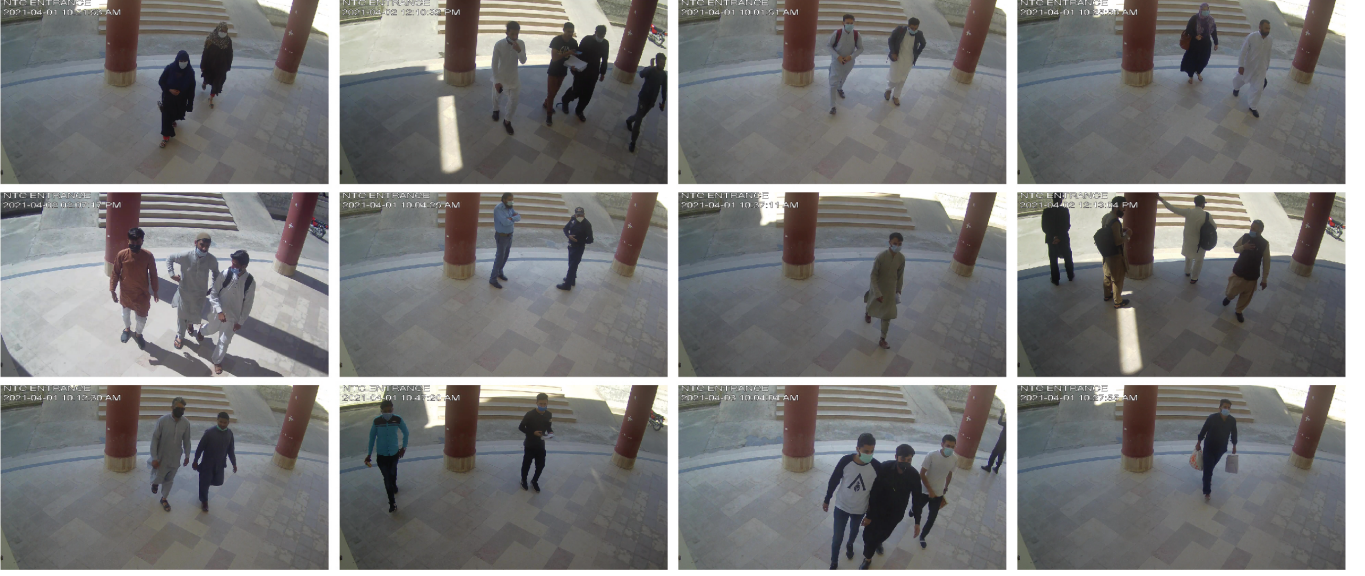
Fig. 2: Sample Images From Our MUST Face Dataset.

problem, which commonly occurs by increasing network layers. Therefore, multi-scale YOLO-v3 has been proposed which hold residual connections—which join the input from the previous layer to output of next layer similar to ResNet architecture. Resultantly, Yolo-v3 achieved good performance even over low resolution images due to inclusion of multi-scale feature extraction property. To this end, we employed the existing YOLO-v3 architecture and inserted k-means anchoring to 9 anchor boxes and then isolate them into three locations to get more more bounding boxes per image than baseline version.